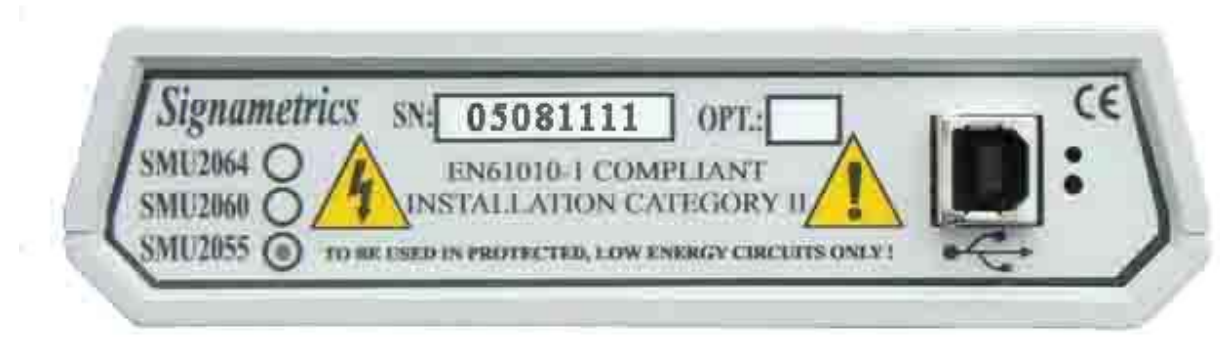
Figure 3-2. The Rear panel has the USB BF type connector. Compatible with BM cable.