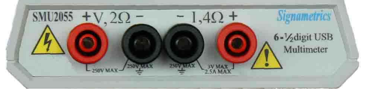
Figure 3-1. The DMM input connectors consist of four Banana jacks.

Before using the DMM, please take a few moments and review this section to understand where the voltage, current, or resistance and other inputs and outputs should be applied. This section contains important information concerning voltage and current limits. Do not exceed these limits, as personal injury or damage to the instrument, your computer or application may result.