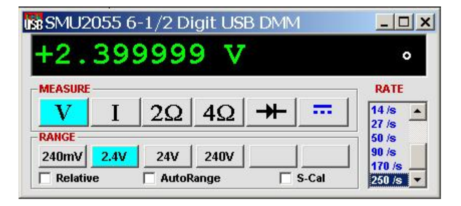
Figure 3-2. The Control Panel. The two main groups include Measurement Function and Range buttons. The Range buttons are context sensitive such that only "240m, 2.4, 24 and 240 appear when in a Voltage Measurement Function is selected, and 2.4m, 24m, 240m and 2.4 appear when a Current Measurement Function is selected, etc.